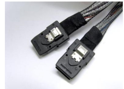
AMPH-8787-XXX: SFF-8087 to SFF-8087 Cable with XXX as the standard or customized length in cm

TEST RESULT AND RECORD Temperature: 23.2 °C